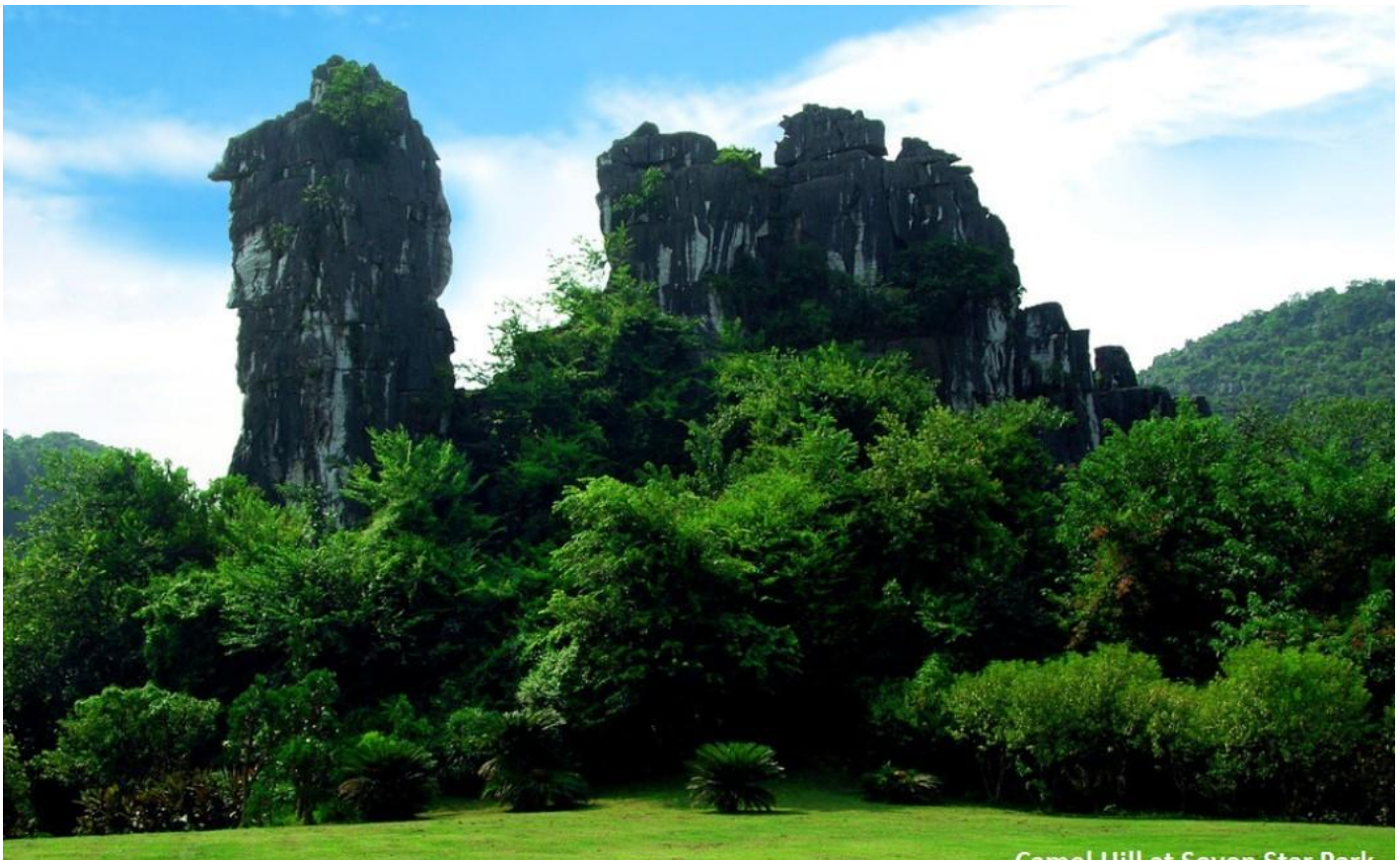
Camel Hill at Seven Star Park 七星公园骆驼山